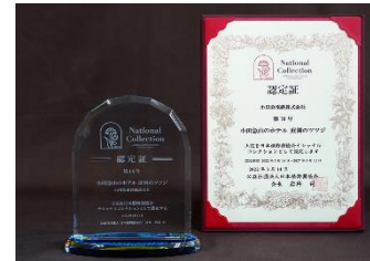
The JABG National Plant Collection Certification and plaque for Azalea Garden