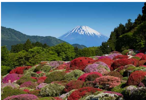
Azaleas in full bloom against the backdrop of Mt. Fuji

Odakyu Hotel de Yama on the shores of Lake Ashi in Hakone will host Azalea and Rhododendron Fair 2024 from late April. The garden’s approx. 3,000 azalea bushes in 84 varieties, including 30 heirloom varieties, and approx.300 rhododendron bushes in 42 varieties, will be in full bloom. Against the magnificent backdrop of majestic Mt. Fuji and beautiful Lake Ashi, visitors are treated to a wonderful view of colorful azaleas in this gorgeous garden. The garden’s azaleas were the 10th to be registered with the National Plant Collection of the Japan Association of Botanical Gardens (JABG) in 2022 as plant heritage being passed down to future generations. In March 2023, the garden’s rhododendrons were the 15th to be registered with the JABG National Plant Collection. In 2024, in commemoration of the registration of the azaleas and rhododendrons in the list of the JABG National Plant Collection and the 75th anniversary of the hotel, Azaleas and Rhododendrons at the Garden of Odakyu Hotel de Yama will be released. This booklet also includes the history of the garden.