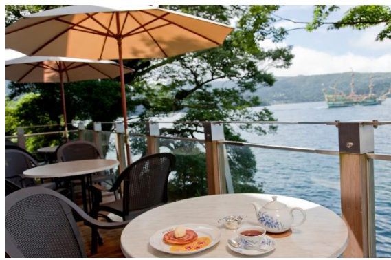
Terrace seats at Salon de thé Rosage