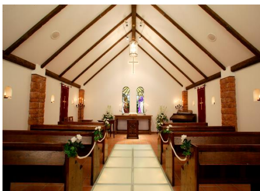
Location: A chapel at Odakyu Hotel de Yama Garden

<Performers> Eimy Martin (Vocal), Yuki Nishiura (Piano)