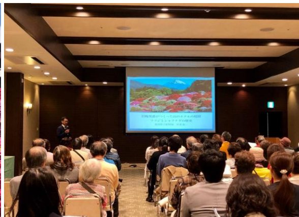
Image for upcoming presentations