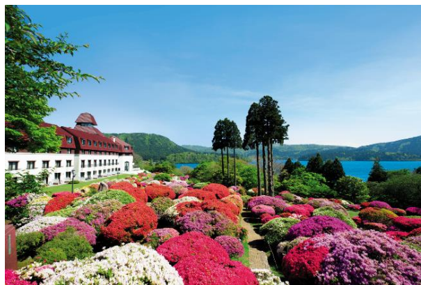
Azalea garden in Odakyu Hotel de Yama and Lake Ashi